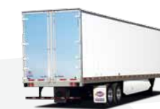
DRY VAN 4000D-X COMPOSITE